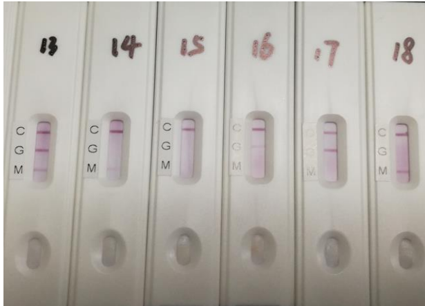
Table 1. The detection sensitivity and specificity of SARS-CoV-2 IgG-IgM combined antibody reagent.